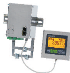
Display Unit And Blackbox

Display Unit W x H x D: 110 x 107 x 35 mm (4.3" x 4.2" x 1.4")