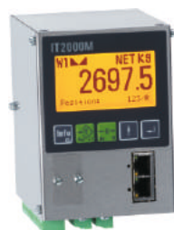
Module With Display

Dimensions W x H x D: 86 x 120 x 106 mm (3.4" x 4.7" x 4.2")